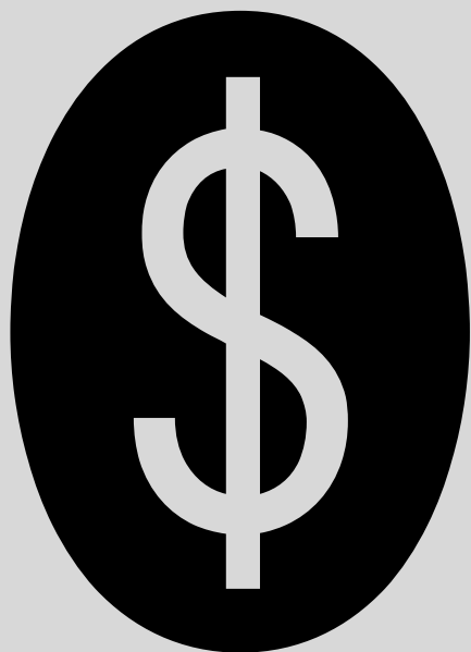
Penitente BT Sans, 259 pt

A graphic showing the word 'TRAY' in a bold, sans-serif font. The letters are slanted to the right, creating a sense of motion and dynamism. The text is arranged in two lines: 'TRAY' and 'TRAY'.