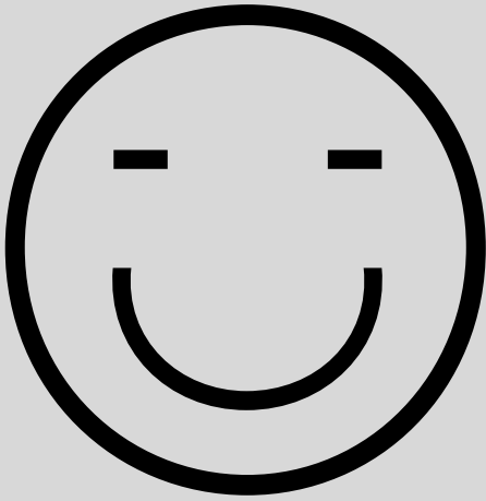
Kiffo BT Symbols, 248 pt

It can also be more like playing and about experimenting with sound just out of curiosity. But in this early stage I can't have a too clear intention of making a finished piece of music. So I had many sessions collecting a lot of recorded material before the idea of the album surfaced.